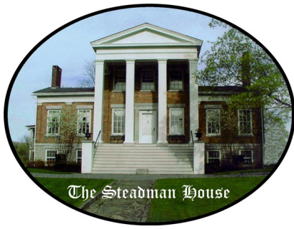
The Steadman House